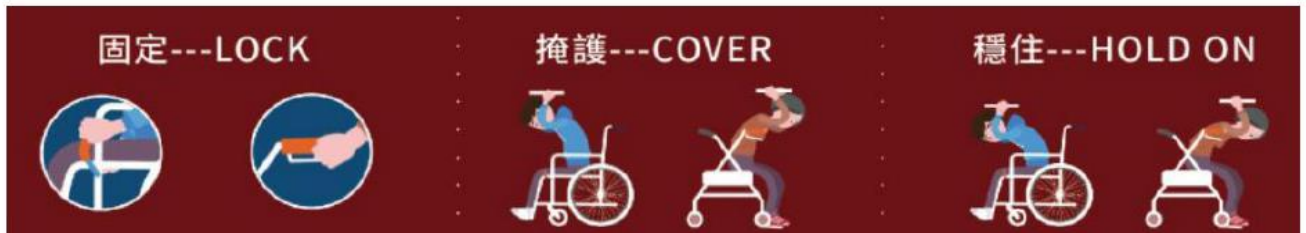
身心障礙者地震避難 3 步驟(固定 Lock、掩護 Cover、穩住 Hold on)