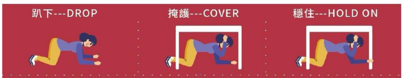
地震避難 3 步驟(趴下 Drop、掩護 Cover、穩住 Hold on)

Carry out evacuation process, and gather at evacuation locations. (See Appendix 2: MCU Taipei Campus Evacuation Locations, as reference).